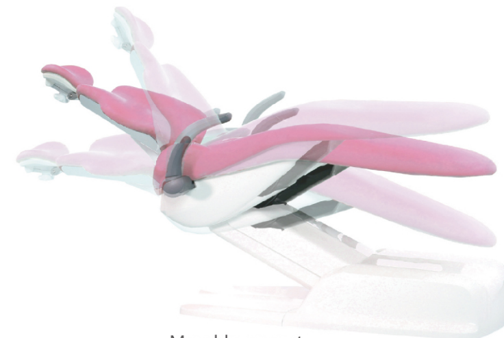
Movable armrest Makes easy entry and exit for patient.