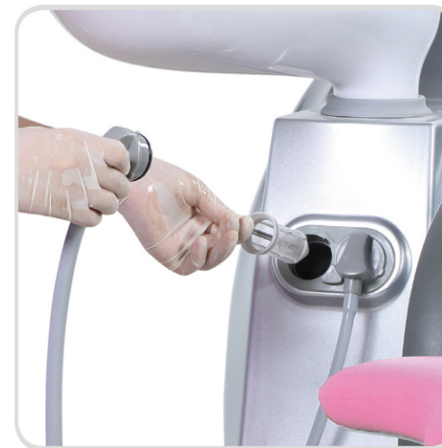
New design filter Better filtration performance sealing against leaking, stronger suction power easy disassembling and cleaning, more durable.