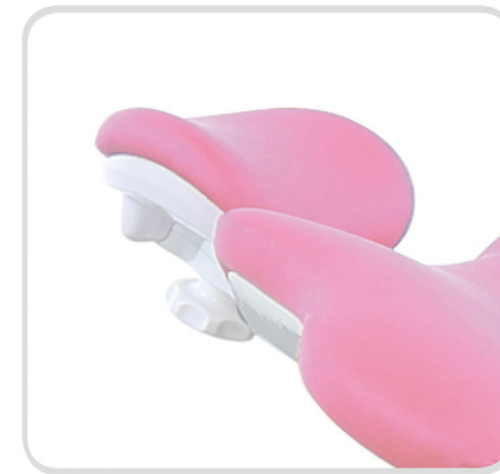
Articulating dual axis headrest