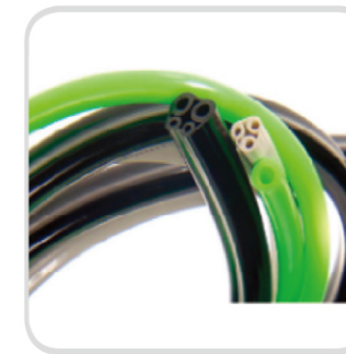
American made tubing All internal pneumatic and water pipelines are sourced from quality manufacturers throughout the world for their high resistance to kinking and bio film build up.