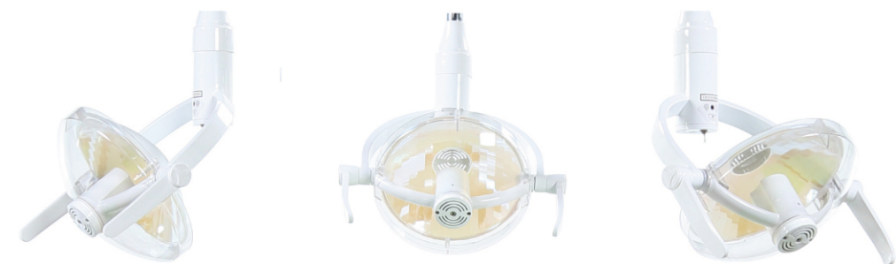
Deluxe dental light with larger light area and sensor

D2 Doctor' s Stool with 4 fuctions AJAX02 dental stool has 4 functions, it is ergonomically designed and engineered. To fit the human body to reduce stress and fatigue. Backrest and stool height are both adjustable.