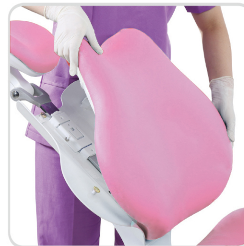
Removable backrest Cushion board use standard plastic molding process, quickly and easily installation and removal. Bottom plate use environmental protection material can prevent the mold in humid environment.