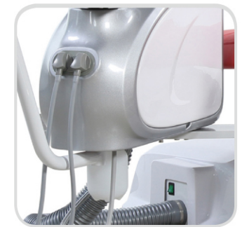
Water bottle one switch control