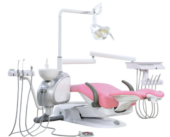
350mm low chair position