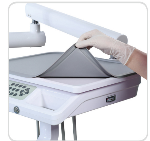
Silicon pad for tray Doctor and assistant tray can provide silicon pad, and silicon and high temperature disinfection.