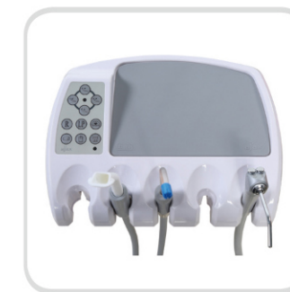
10 function control panel Convenient assistant know control of the function of dental chair.