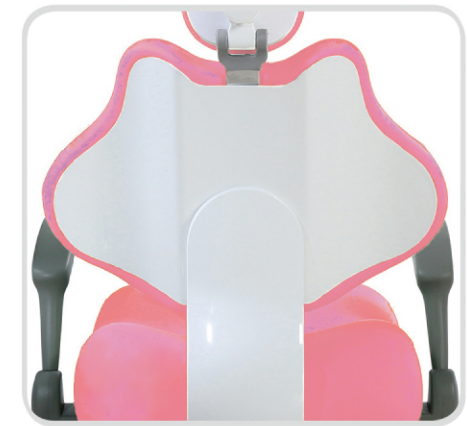
Cast aluminum chair and backrest support